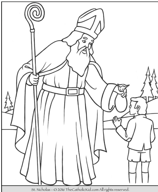
St. Nicholas